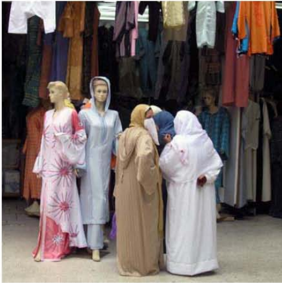
Moroccan women shopping in Casablanca

The attractive 37-year-old brunette's come-hither picture on the website that provides information about the quarterly magazine in English and Arabic adds to the marketing cachet surrounding this controversial publication that will not be very visible on Lebanese or Arab newsstands.