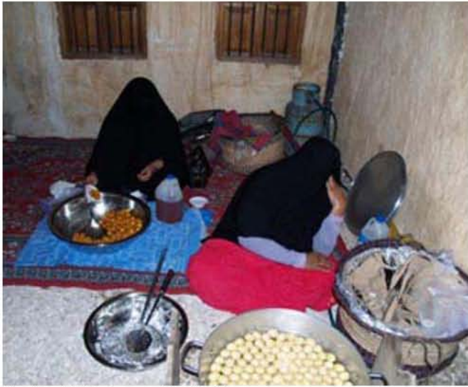
Traditional Qatan women (Abu-Fadil)

By contrast, the Jasad website is chock full of tantalizing subjects, and provides links to erotic sites, a selection of eye-popping art works the faint-hearted may wish to skip and a bloggers' page where readers can leave their mark.