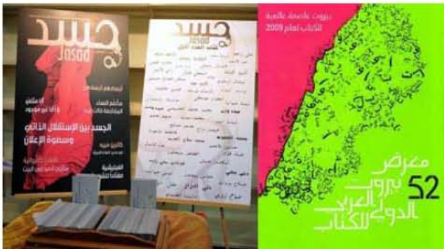
Jasad at Beirut Book Fair (Jasad)

The magazine is published in Arabic - the website is in Arabic and English -- and covers international topics on the body from books to exhibitions, to the theater and movies. It was even promoted at the recent Beirut International and Arab Book Fair.